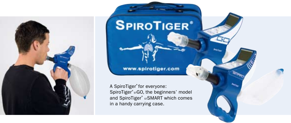
A SpiroTiger® for everyone: SpiroTiger® STGO , the beginners' model and SpiroTiger® STSMART which comes in a handy carrying case.

Respiratory training with SpiroTiger® is easy to learn and produces noticeable results even with little effort. The result: increased competitiveness, optimised, efficient breathing and generally improved fitness.